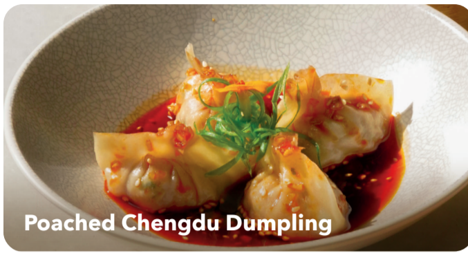
Poached Chengdu Dumpling