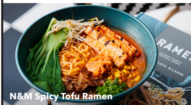
N&M Spicy Tofu Ramen

N&M Shoyu Ramen with BBQ Chicken 650 Rich chicken broth with soy sauce and topped with grilled BBQ chicken, bok choy, chilli oil, ramen egg, and nori sheet