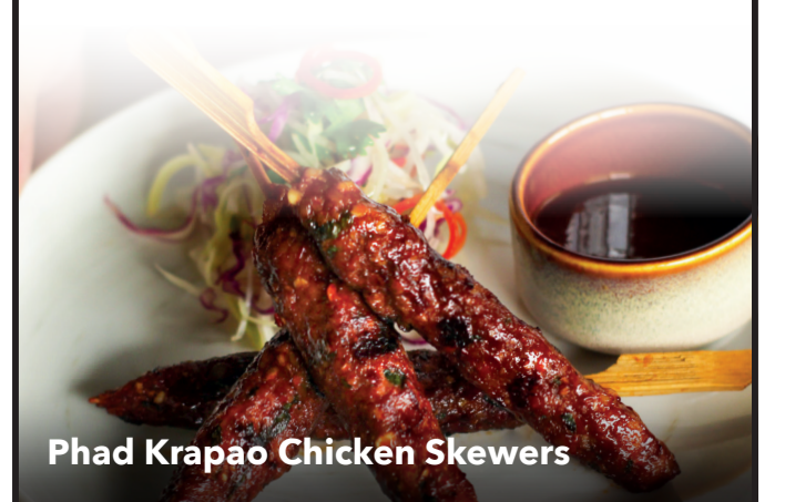
Phad Krapao Chicken Skewers